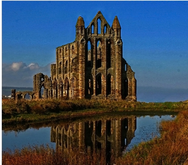
Whitby Abbey Reflections

This is a u3a member trip picking up in Littleborough and Rochdale. The cost of the coach is £33. You can sign up for the trip at the monthly meeting in June but please book directly with Ellen Smith's Coaches – this avoids us taking in the money then transferring it to them. Please call them on 01706 648126 and tell them you are booking the u3a trip to Whitby.