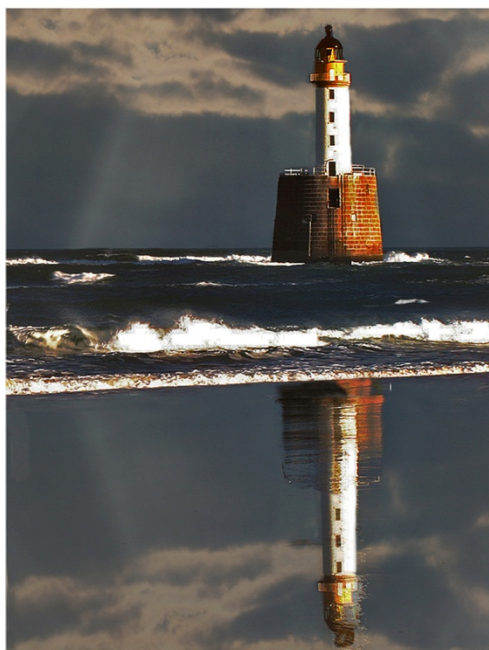
Rattery Head Lighthouse – our photographer was in reflective mood.