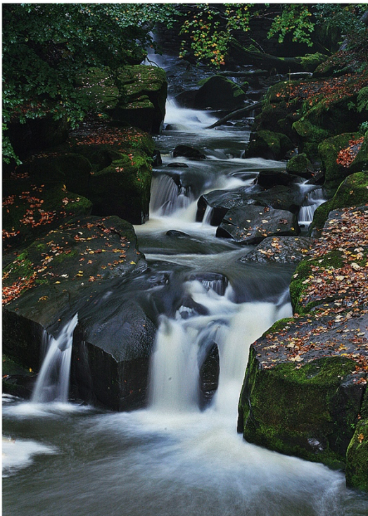
The river in Healey Dell

I hope you find plenty of interest here.